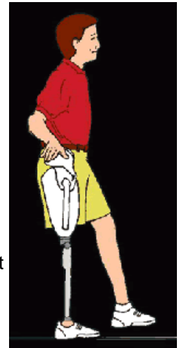
Figure 1. Poor walking biomechanics increases the forces on the sound foot creating greater risk for skin breakdown and ulcers.

Able-bodied diabetic subjects with peripheral neuropathy have a high risk for developing ulcers on the sole of the foot, and it is believed that most of these ulcers develop during walking. Fifty percent of diabetic amputees will also develop sound-foot infections and possible amputation within two years of the amputation of the first foot; therefore, clinicians working with a diabetic amputee must be alerted to the potential of complications that may arise in the residual foot. The term "sound" limb can be very misleading.. In fact, it is probably just a twist of fate that one foot became infected before the other and thus only a matter of time before problems begin to arise with the sound limb if the patient does not take extreme care. The odds are certainly working against the amputee, especially if any other foot deformity is present, such as toe clawing or flat feet, as the amputee learns to use his or her prosthesis.